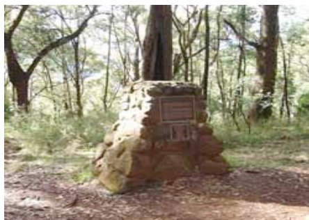
The 1978 Memorial cairn