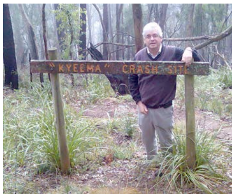
Sunday July 27, 2008