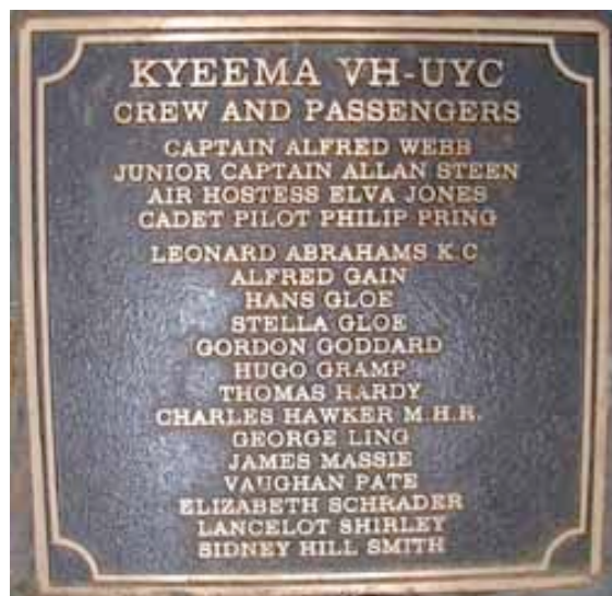
The plaques above the Kyeema crash site