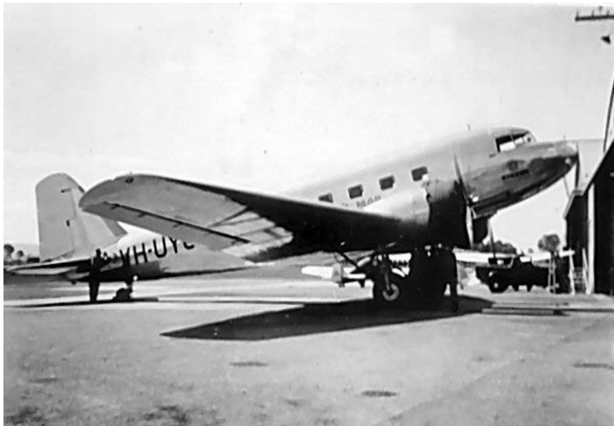
Douglas DC-2 Kyeema VH-UYC